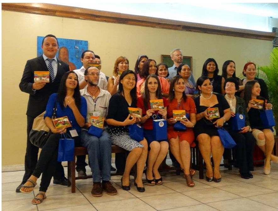
HELTA Honduras TESOL our national and international presenters were showered with much appreciation by Centro Cultural Sampedrano.